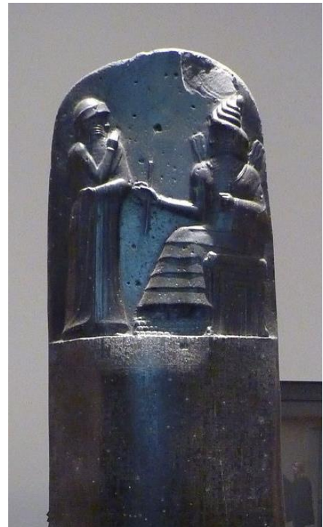
An "image" of the Babylonian king Hammurabi (left) receiving authority from the sun god Shamash, god of justice. This image sits atop a cuneiform stele (a pillar monument) that contains Hammurabi's law code (ca. 1750 BCE). Taken at the Louvre, April 25, 2010 by Unknownctj71081 (Flickr: Hammurabi's Code) [CC BY-SA 2.0 ( http://creativecommons.org/licenses/by-sa/2.0/ )], via Wikimedia Commons

The writers and editors of Genesis strike at the heart of this widespread political theology by asserting that, while kings may well claim to be the "image of God" on earth, they rightly do so only by virtue of their birth as a human being. God, the biblical writers assert, makes every human being, woman or man, to be "the image of God" in the earth and thus empowered to govern. We are not, as the imperial myths would have us believe, born to