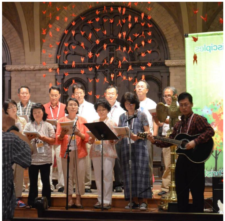
Worship at NAPAD Convocation 2014 at the University of Chicago.

Through Disciples Mission Fund, North American Pacific/Asian Disciples gives witness to the healing, restoring work of Christ in the world, celebrating wholeness and helping the church and the world welcome the glorious diversity of the human family to an open table of healing love.